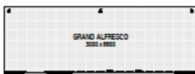
OPTION GRAND ALFRESCO